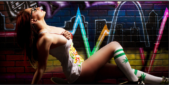
8 Raven Hide